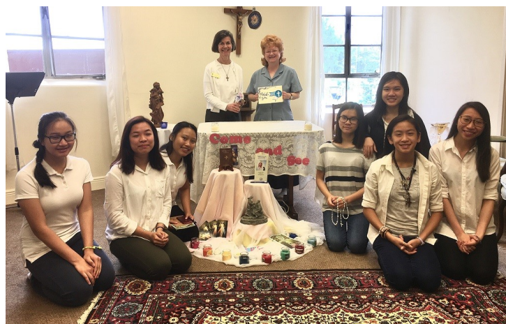
MHD hosted the 2nd Annual Sisters of the Holy Rosary Come and See gathering this summer welcoming seven young women to learn more about religious life.